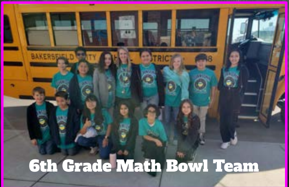
6th Grade Math Bowl Team